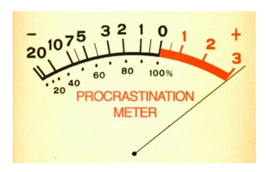
Plan your work, work your plan!